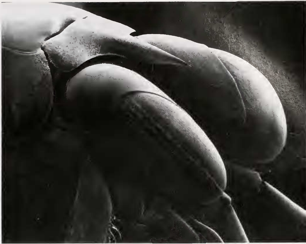
Figure 1. The anterior end of an adult mantis shrimp, Neogonodactylus oerstedii , imaged by scanning electron microscopy. This species is found throughout the Caribbean, living in coral rock and coralline algae. The visual regions of the compound eyes, revealed here by the densely packed facets (each of which represents the cornea of a single ommatidium), lie at the ends of stalks that pivot at their proximal ends. Each compound eye consists of two flattened hemispheres separated by six parallel rows of ommatidia, called the midband. Magnification: approx. 30 \times .

Figure 2 is a diagram of a typical ommatidium from the hemispherical regions of the eye outside the midband. The top half of this structure, including the refracting cornea and the underlying crystalline cone, is devoted to optics, focusing light on the top of the photosensitive structure, called the rhabdom. This rhabdom is constructed from eight receptor cells formed into a single light guide. It consists of a small upper tier, produced by receptor cell number 8 (R8), and a much longer underlying tier formed by contributions from receptor cells numbered 1 to 7 (R1–7). R8 is sensitive only to ultraviolet light (Cronin et al. , 1994b; Marshall and Oberwinkler, 1999), but the fused receptor produced by R1–7 is sensitive to middle-wavelength light, near 500 nm (see Cronin and Marshall, 1989a, b). The R8 receptor is polarization-insensitive, as its microvilli are not all parallel, but the two sets of receptors in the main rhabdom have orthogonal microvilli and are very sensitive to the plane of polarization (see also Marshall, 1988; Marshall et al. , 1991a). Axons from these two receptor sets converge onto higher order interneurons (Horwood and Marshall, unpubl. obs.), which could explain how polarization opponency arises in mantis shrimp vision (see Yamaguchi et al. , 1976).